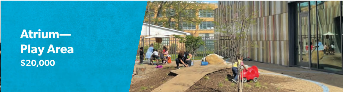
Atrium—Play Area $20,000