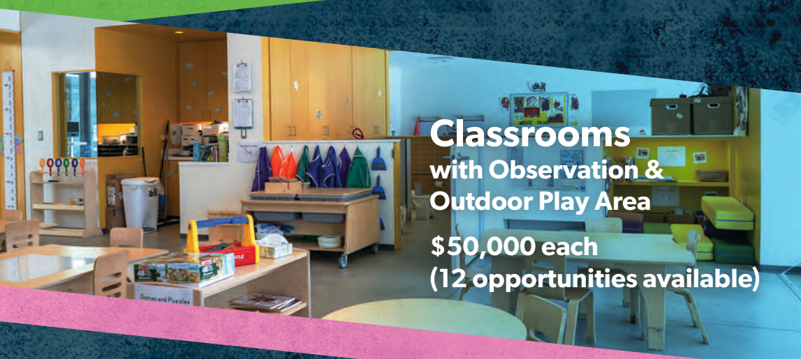
Classrooms with Observation & Outdoor Play Area $50,000 each (12 opportunities available)