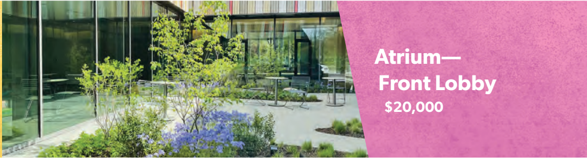
Atrium—Front Lobby $20,000