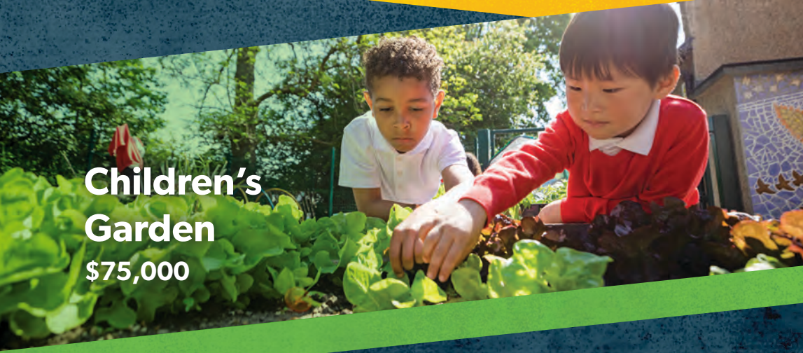
Children's Garden $75,000