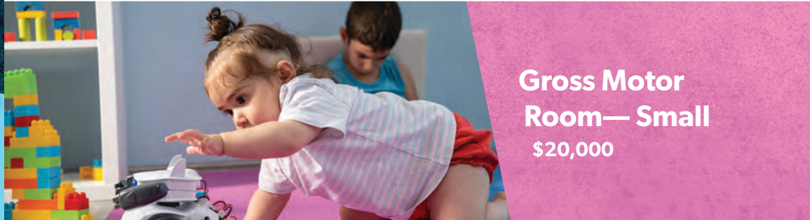
Gross Motor Room—Small $20,000