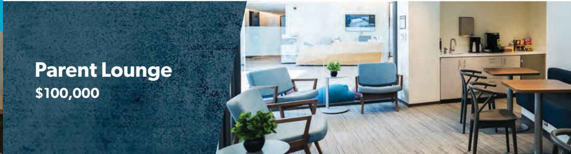
Parent Lounge $100,000