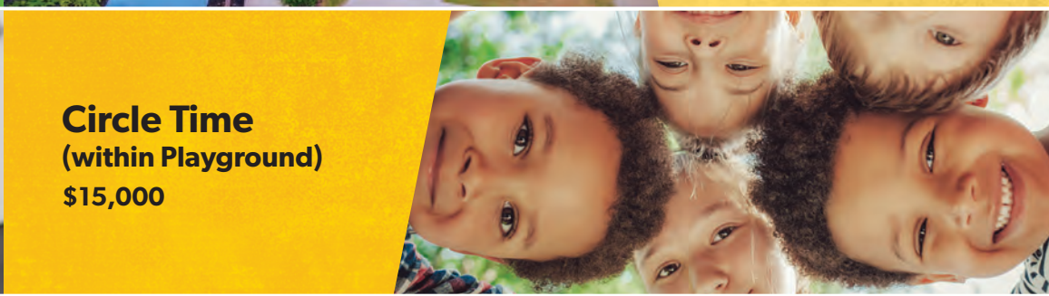
Circle Time (within Playground) $15,000