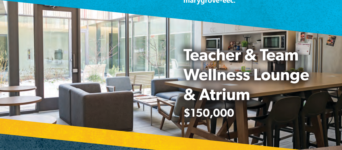
Teacher & Team Wellness Lounge & Atrium $150,000

Current investment opportunities are listed on our website: starfishfamilyservices.org/marygrove-eec .