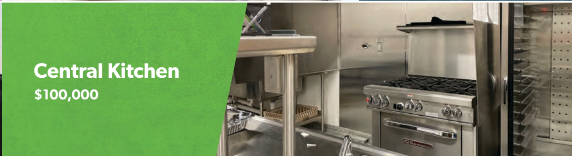
Central Kitchen $100,000