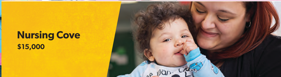
Nursing Cove $15,000